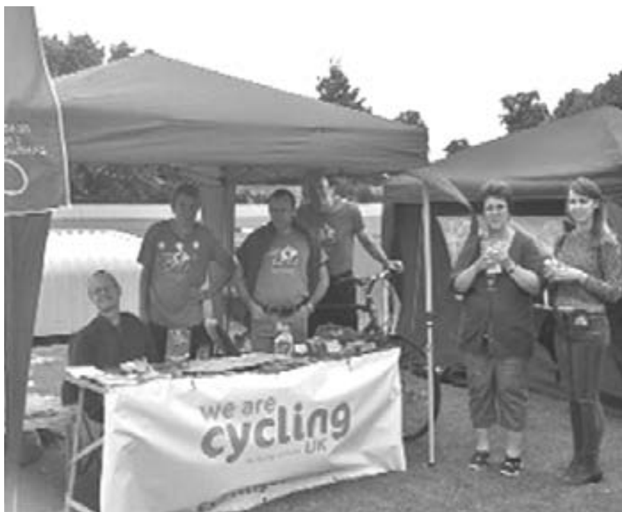
RCC stand at the East Reading Festival

Our next event is a stand at the Big Town Meal on Saturday 1 October, 10am-4pm, in conjunction with Reading Bicycle Kitchen (RBK).