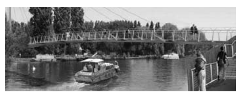
Artist's Impression of the New Thames Pedestrian Bridge

would be desirable as cyclists already frequently have to move onto the adjacent grass to pass pedestrians.