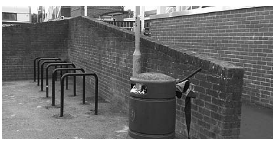
Cycle racks on Oxford Road side of Wokingam Station

I can now point to my first direct achievement as Wokingham Campaign Co-ordinator. There are now cycle racks on the Oxford Road side of Wokingham station, as well as the main cycle sheds on the town side (see photo). I hope these will prove useful to people commuting towards Reading, and they may also discourage the location's previous use as a smoking area and informal night time toilet. Currently the racks aren't covered, but I hope we'll be able to persuade someone to provide a roof if they become popular.