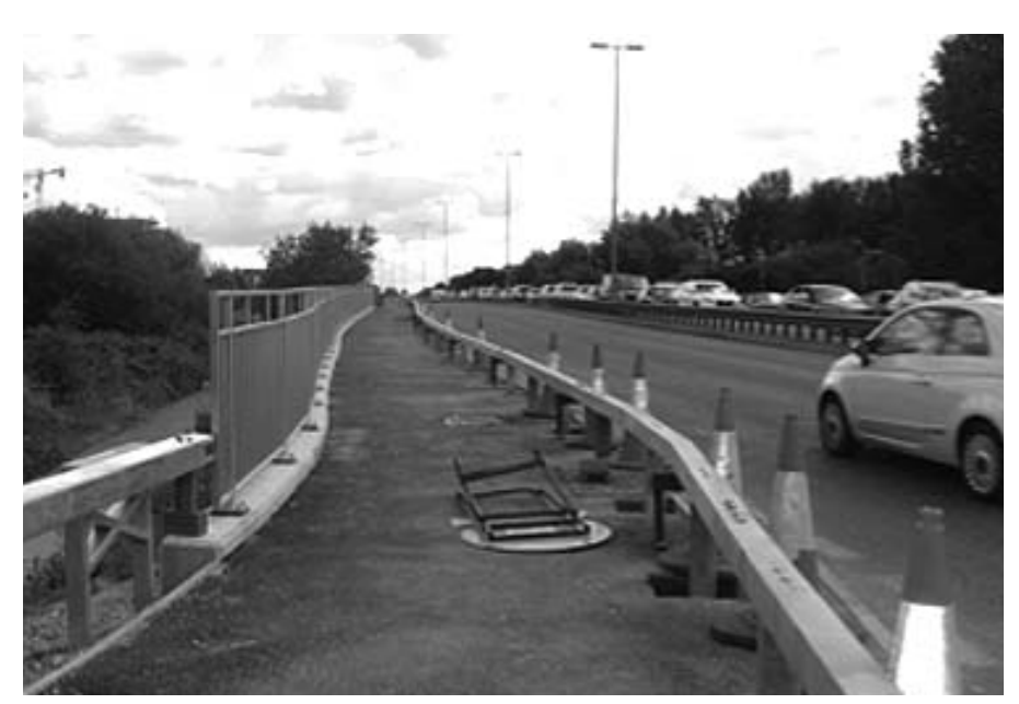
Map showing the missing cycle link and and view of the works on the A33 bridge