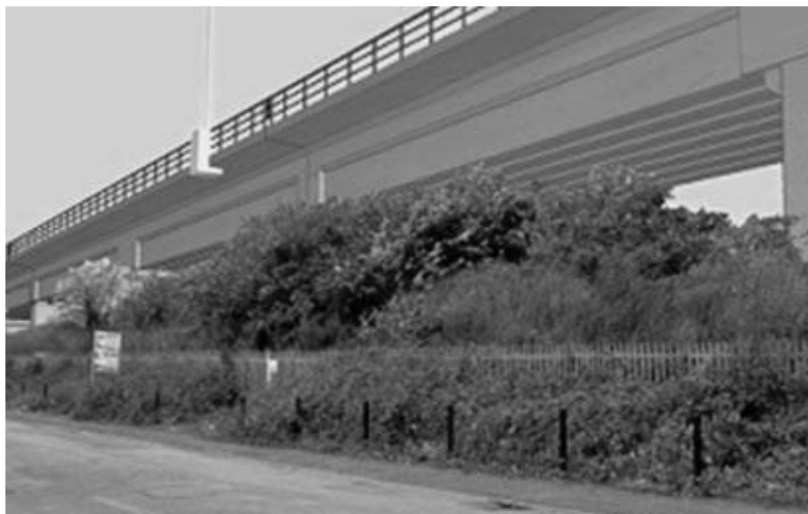
A representation of the new rail viaduct near Cow Lane