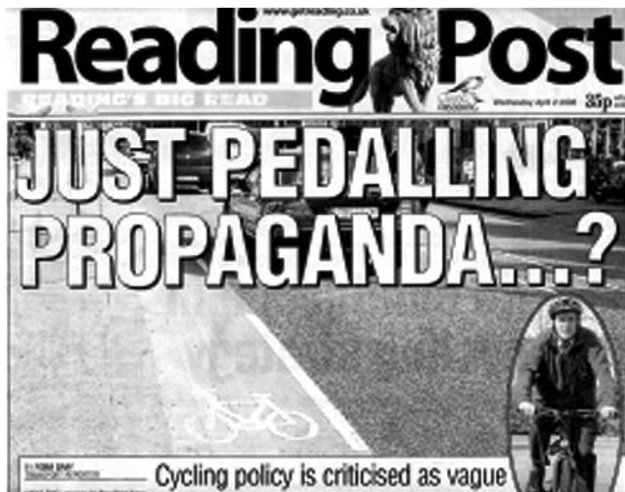
Making the front page in the Reading Post regarding Cow Lane

The second achievement that stands out is the saving of Cow Lane to through traffic. In 2007 Network Rail's plans for relieving the train bottleneck in Reading was to close Cow Lane so that the rail line could be lowered,