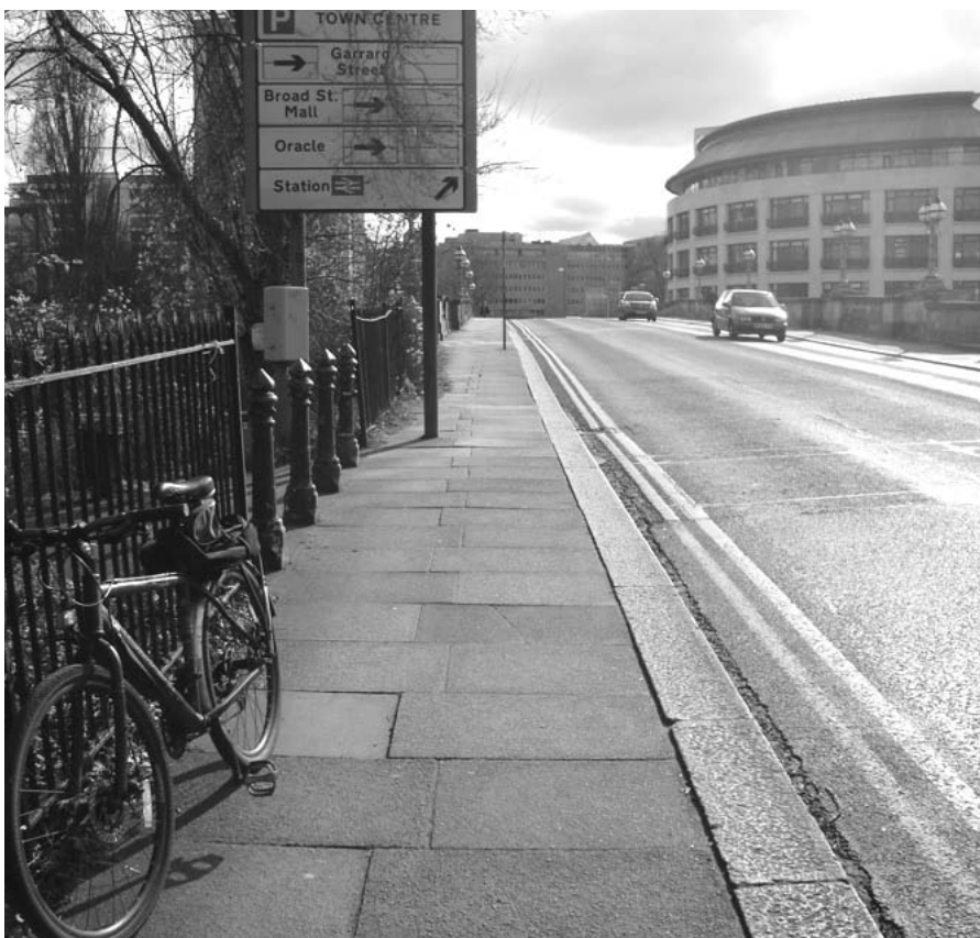
Reading Bridge - on carriageway cycle lanes planned under the LSTF scheme

The series of Local Sustainable Transport Fund (LSTF) workshops (see page 2) has now looked at cycling improvements in north, east and south Reading. The shortlisted schemes that get taken forward from these workshops take time to rumble through the Council's democratic and technical processes. Consequently we have to wait some time for a good idea to turn into a reality.