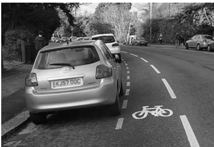
Dangerous Cycle Lane on Wokingham Road in Reading

Cycle Census Volunteers for Tuesday 16 June, see page 5.