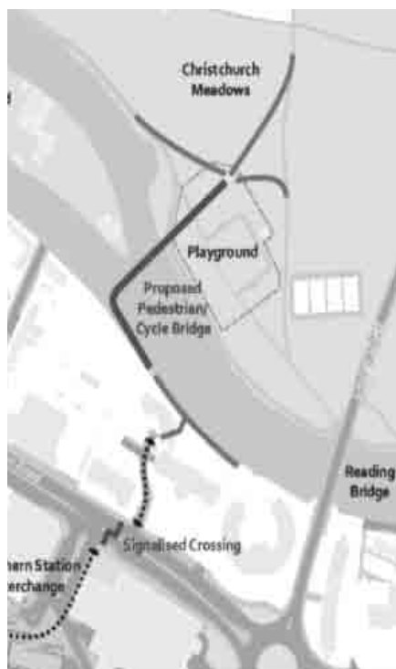
Position of new pedestrian/cycle bridge in relation to station and Reading Bridge

far. What is not known is whether the cycle lane scheme on Reading Bridge would have gone ahead if the new bridge had not been made possible by the large LSTF award made in July last year.