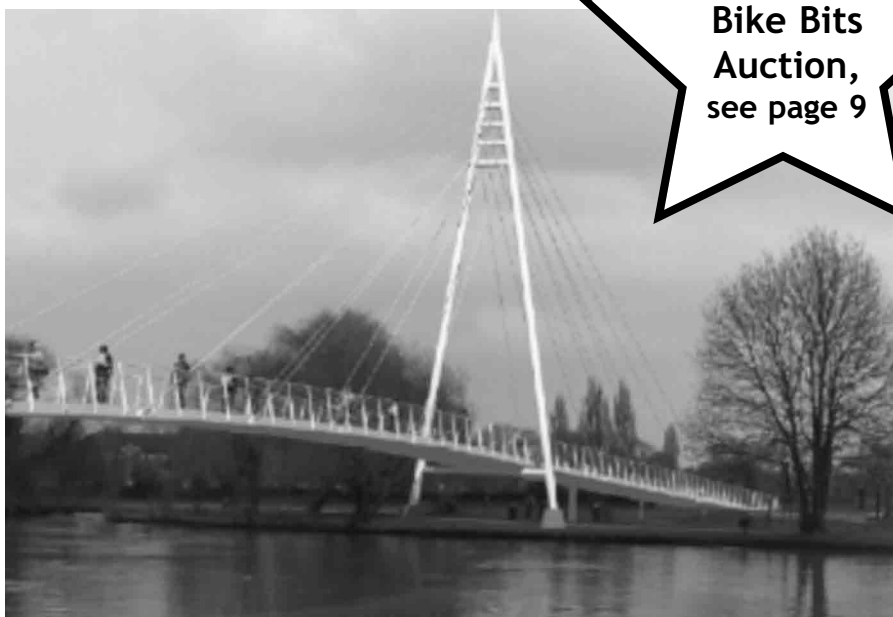
Artist's impression of the new bridge

To the north of the bridge, a new foot/cycleway is proposed to link to the existing footpath running north-south through Christchurch Meadows.