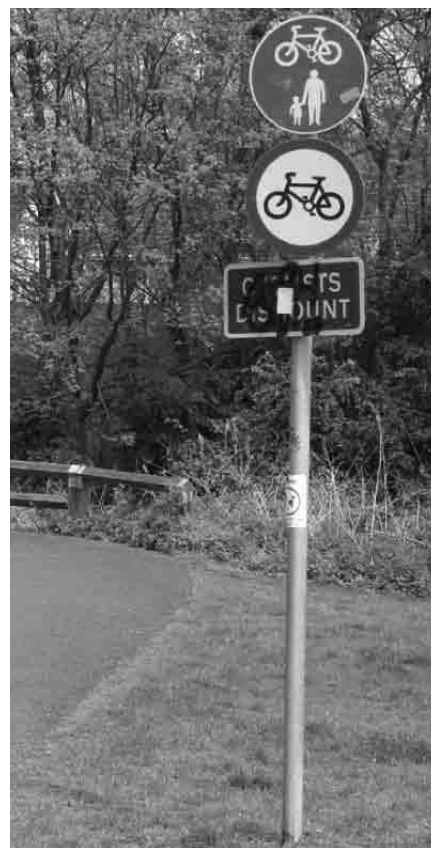
Homage to Magritte: surrealism comes to Wokingham cycle facilities