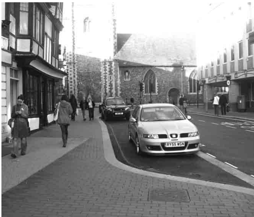
Cars parked in Market Square in what could be a contra-flow cycle lane