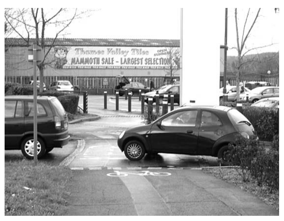
The Oxford Road cycle path next to Waitrose

complaining that cyclists were using the carriageway on Oxford Road and Portman Road instead of the cycle lanes (i.e. the pavement). The letter writer was extremely peeved that "if we were to clip or knock them off their bikes, we would get the blame". Have a look at our Facebook Page (the entry dated on 21 October) if you want to see the letter and our response.