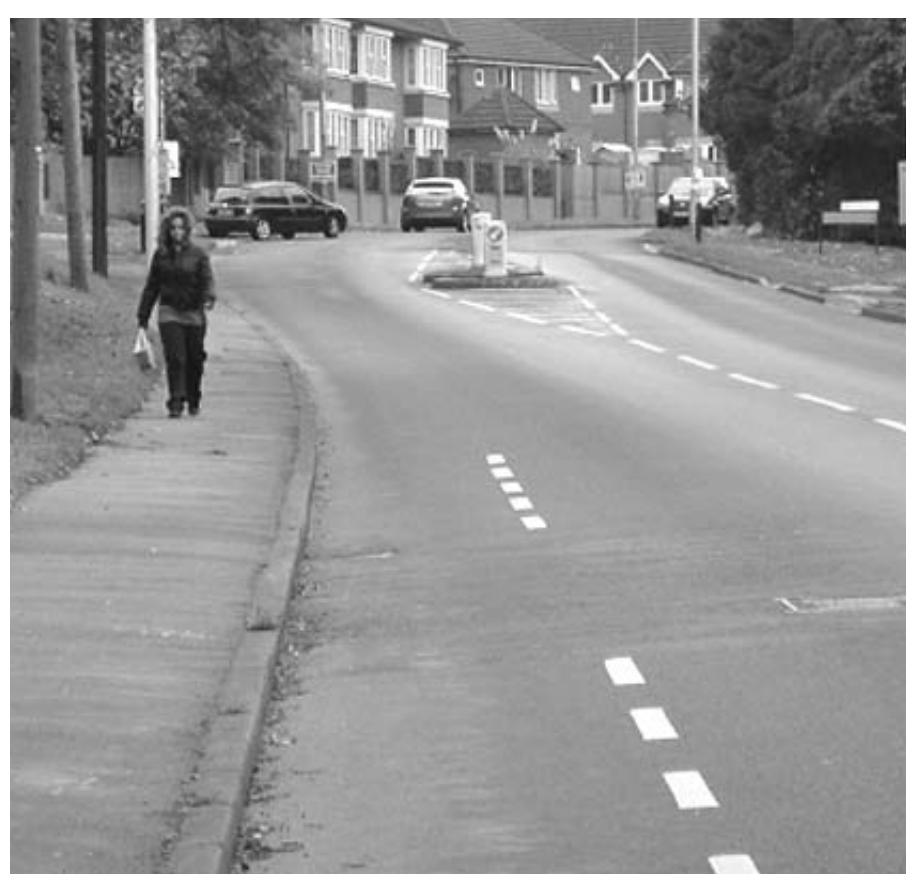
Quasi-cycle lanes petering out on the Meadway